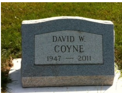
Just recently delivered from Blast Craft

Rienzi offers a full-service monument business for property owners at Rienzi. We work with Blast Craft Service, Inc. out of Slinger WI. Blast Craft's goal is to deliver more than their customers expect. When it comes to the supply of granite memorials they strive to see how much value they can pack into every interaction between their company and Rienzi. They believe that customer care is the all important factor that separates them from their competition.