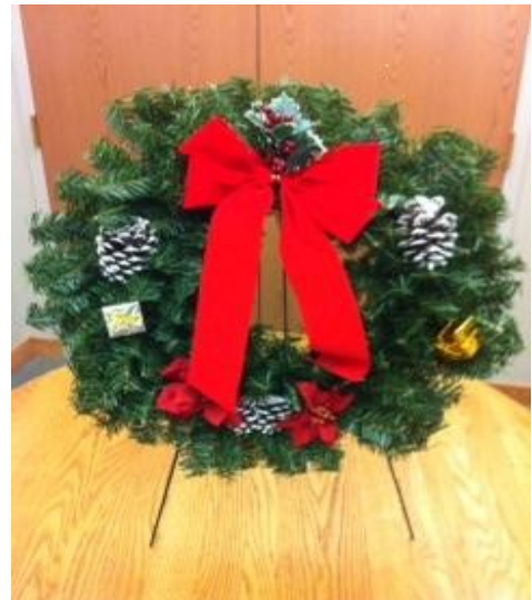
Christmas Wreath $25.00

Call the office at 920-922-4543 with questions