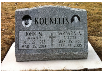
New arrival from Blast Craft

Rienzi offers a full-service monument business for property owners at Rienzi. We work with Blast Craft Service, Inc. out of Slinger WI. Blast Craft's goal is to deliver more than their customers expect. When it comes to the supply of granite memorials they strive to see how much value they can pack into every interaction between their company and Rienzi. They believe that customer care is the all important factor that separates them from their competition.